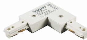
ZCS170 LCP 1C