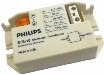
ET-E 10 W LED 220-240V