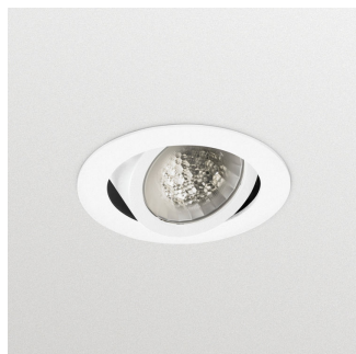
LuxSpace Accent Mini G3 - LED Module, system flux 1100 lm