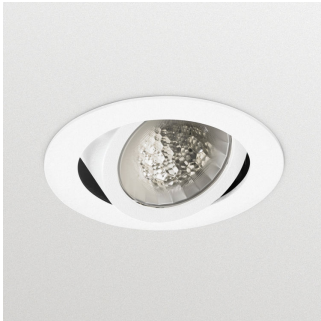
LuxSpace Accent Compact G3 - LED Module, system flux 1700 lm