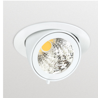
LuxSpace Accent Compact G3