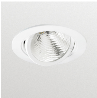
LuxSpace Accent Performance G3 - LED Module, system flux 2700 lm