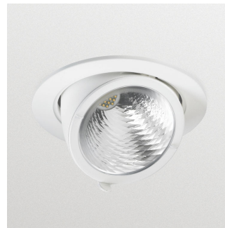
LuxSpace Accent Performance G3 - LED Module, system flux 1900 lm