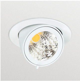
LuxSpace Accent Compact G3