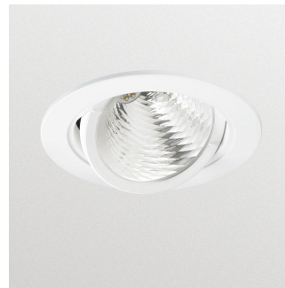
LuxSpace Accent Fresh Food RS751B adjustable spotlight with LED light source, performance version