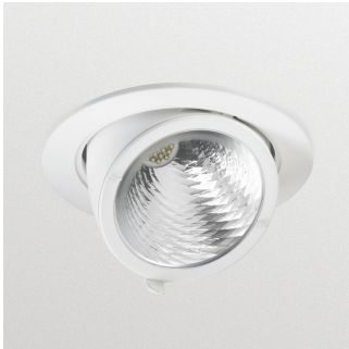
LuxSpace Accent Fresh Food RS752B elbow spotlight with LED light source, performance version