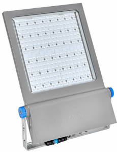
Clearflood Large Floodlight