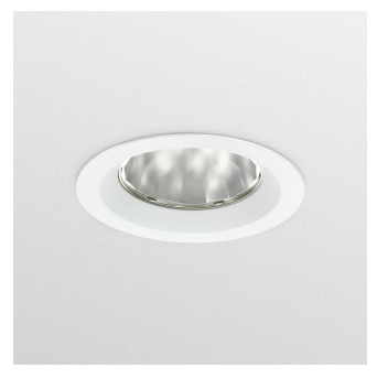
GreenSpace Accent Fixed-RS340B