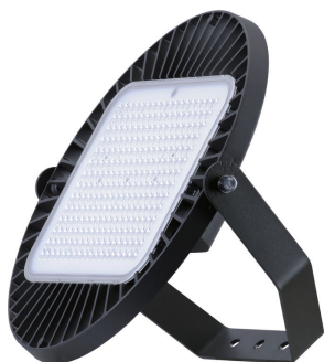
GreenPerform Highbay G3 BY698P with Bracket