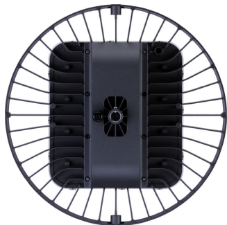
GreenPerform Highbay G3 BY698P Fixed Back