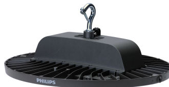
GreenPerform Highbay G3 BY698P Fixed Side