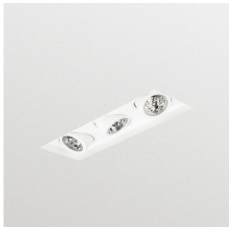
StoreFlux GD613B recessed rimless LED gridlight