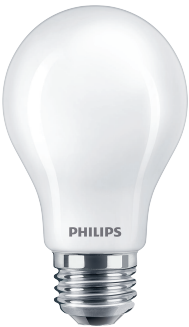
Single Contact Medium Screw A19 (A19) Frosted