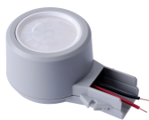
BY288X PIR Sensor Ordercode 911401517331