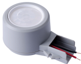
GreenUp Lowbay G2 BY288P Sensor