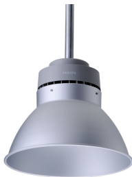
BY268Z RL Ordercode 911401541511, 911401542111