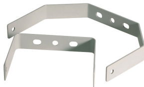
BY269Z MB Ordercode 911401541911, 911401542011