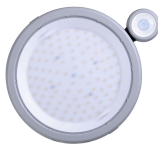
GreenUp Lowbay G2 BY288P PIR Front