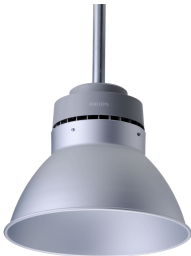
GreenUp Lowbay G2 BY288P w Reflector