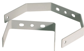
GreenUp Lowbay G2 Mounting Bracket