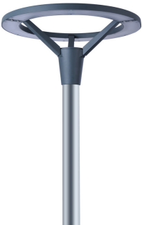
Smart Post top G3 BGP161