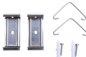
WT066C Mounting Bracket Detail Photo