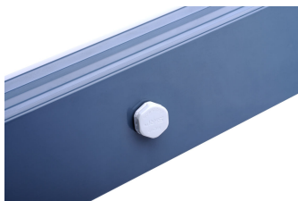
WT066C Breather Detail Photo