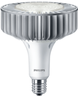
True Force E40 T50