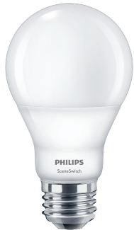
Single Contact Medium Screw A 19mm Frosted