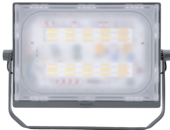
Smartbright LED Floodlight BVP173 LED66 Front