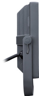
Smartbright LED Floodlight BVP173 LED66 Side