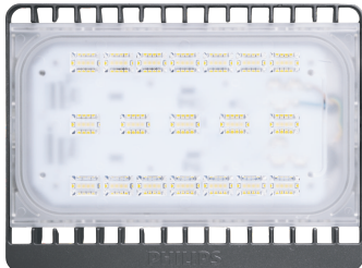
Smartbright LED Floodlight BVP172 50W Front