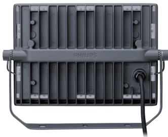
Smartbright LED Floodlight BVP173 LED66 Back