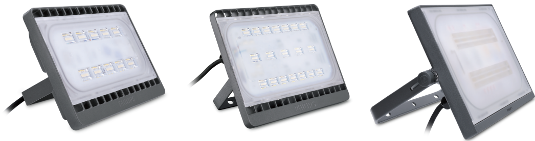
BVP172 50 W