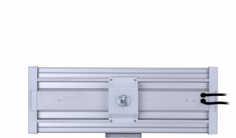
GreenUp Highbay G2 BY560P LED105 B