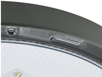
TownTune ASY DR BDP266