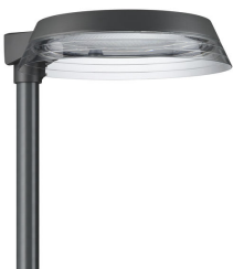
BDP266, TownTune asymmetric with decorative ring