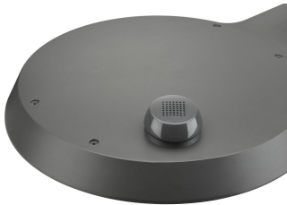
TownTune ASY BDP265