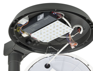
TownTune ASY BDP265