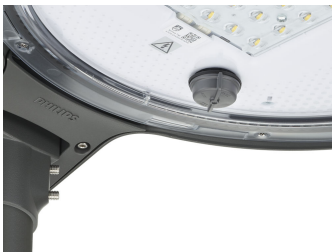
TownTune ASY BDP265