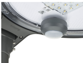
TownTune ASY BDP265