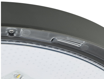
TownTune ASY DR BDP266