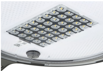
TownTune ASY BDP265