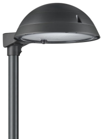
BDP268, TownTune asymmetric with decorative top dome