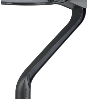
TownTune LYR BDP270