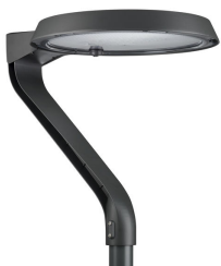
BDP270, TownTune with lyre