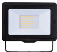
Essential SmartBright G3 LED Floodlight 3