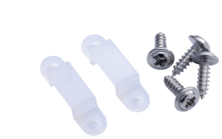
ZGC201 Mounting Kit

Ordercode 911401720292, 911401720322, 911401720332