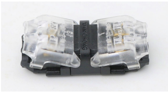
ZGC201 Cable Connector

Ordercode 911401720292, 911401720322, 911401720332