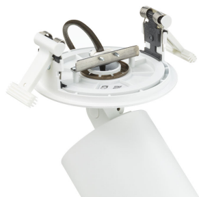
StyliD Evo ST770B semi recessed installation rim