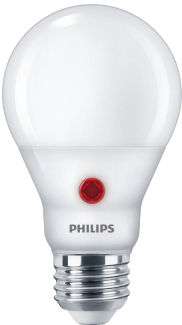
Single Contact Medium Screw A19 (A19) Frosted