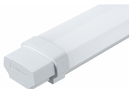
Smartbright Waterproof G3