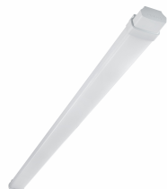
Smartbright Waterproof G3