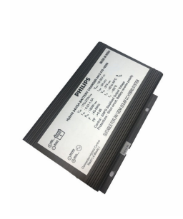
ComboCC Gen 4.0 Hybrid Supply Unit