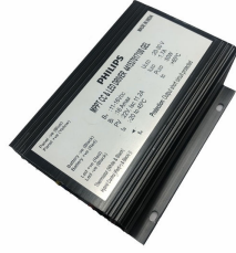
ComboCC Gen 4.0