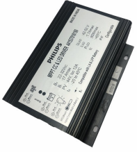
ComboCC Gen 4.0