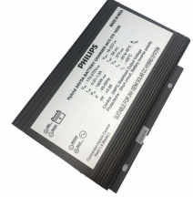
ComboCC Gen 4.0 Hybrid Supply Unit