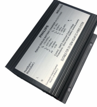
ComboCC Gen 4.0 Hybrid Supply Unit