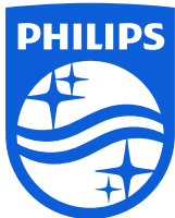
TUV 48T5 HE G5