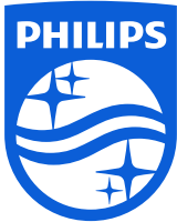
TUV 24T5 HO 4P SE