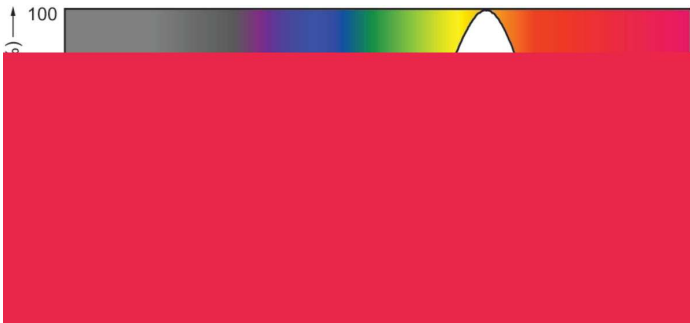
Spectral Power Distribution Colour - MASTER LED 4-35W 3000K MR16 36D