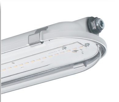
Standard clear lens