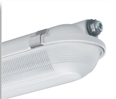
WHP - Wide beam optic and prismatic acrylic lens