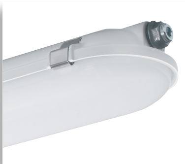
LFA - smooth frosted acrylic lens