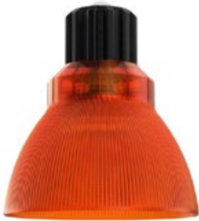
ORTP Fluo Orange