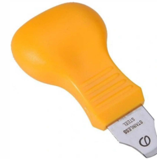
Watch Casing knife - Head width on outer end 10mm (wider is OK too) - Head thickness 1.5mm (smaller is OK too)