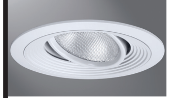
376W White Trim, White Baffle

Compatible with Halogen, Incandescent, LED* or CFL* lamps.