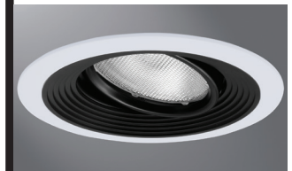
376P White Trim, Black Baffle