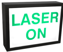
GW - Green Letters on White Sign Panel