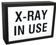
BW - Black Letters on White Sign Panel