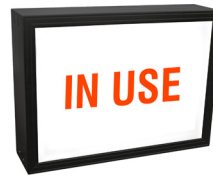
RW - Red Letters on White Sign Panel