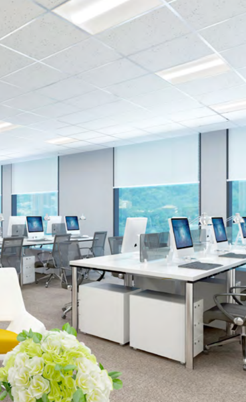
Diffuse round lens