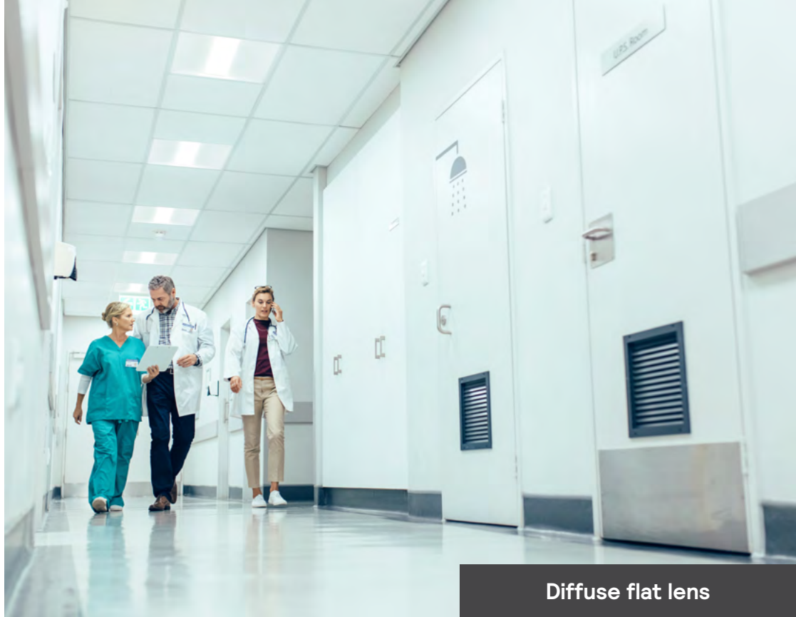
Diffuse flat lens