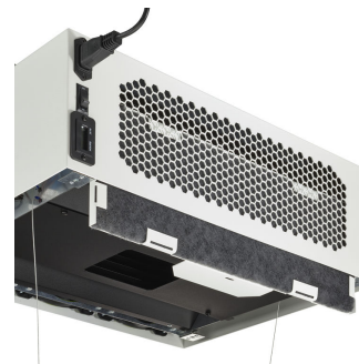
Dust filter fixation