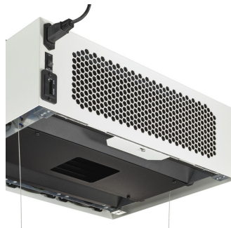
Inside the UV-C Active air unit