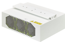
Fixation to ceiling or wall