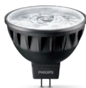
Master LED ExpertColor D 6.5 - 35W D 7.5 - 43W MR16 9290013417, 9290013860