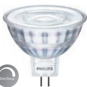
Master LEDspot DimTone 5-35W MR16 9290019047