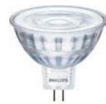
LED 4.6 - 35W MR16 WW 60D D RF 1PF/12 9290024941

This document is for information purposes and must be treated as recommendation. Signify attempted to provide best results, results are generated in lab conditions and might contain faults