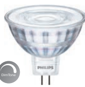
Master LEDspot Dimtone 7 - 50W MR16 9290020589

This document is for information purposes and must be treated as recommendation. Signify attempted to provide best results, results are generated in lab conditions and might contain faults