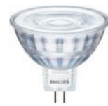
MAS LEDspotLV DimTone 5.8-35W MR16 36D 9290024931

This document is for information purposes and must be treated as recommendation. Signify attempted to provide best results, results are generated in lab conditions and might contain faults