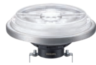
Master LEDspot Expertcolor 11-50W AR111 9290022388

This document is for information purposes and must be treated as recommendation. Signify attempted to provide best results, results are generated in lab conditions and might contain faults