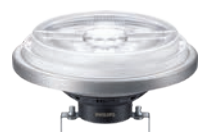
Master LEDspot Expertcolor 15-75W 9290022390