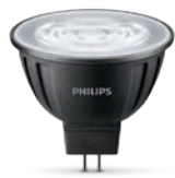
Master LEDspot D 8-50W 9290018815

This document is for information purposes and must be treated as recommendation. Signify attempted to provide best results, results are generated in lab conditions and might contain faults