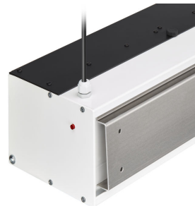
Wall mounting plate and indicator light