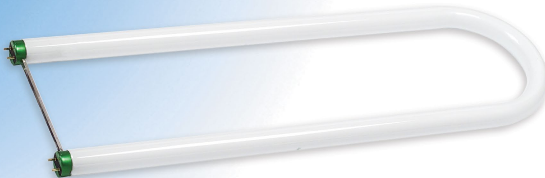
Philips Energy Advantage T8 U-Bent Lamps Rated Average Life

Ideal for commercial applications with 2' x 2' fixtures