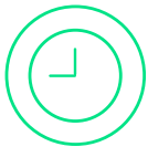
Time to market in lighting speed