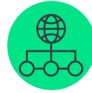
5G Use Cases