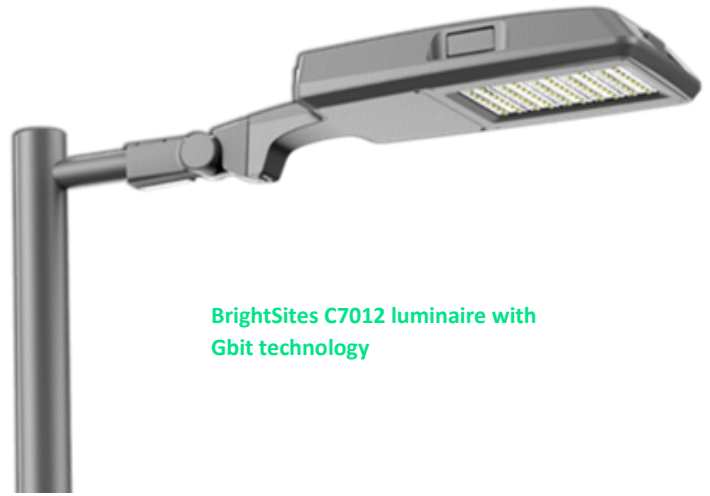
BrightSites C7012 luminaire with Gbit technology

BrightSites C7012 luminaire with Gbit technology is a new point to multipoint 60GHz product that turns lighting grids into high-bandwidth communication infrastructures. It offers the advantages of a high-quality lighting system and mmWave spectrum - multi-gigabit capacity, immunity to interference and massive amounts of available spectrum. All in an easy-to-deploy solution for scalable, stress-free coverage extension and multi-path reliability across neighborhoods and business parks.