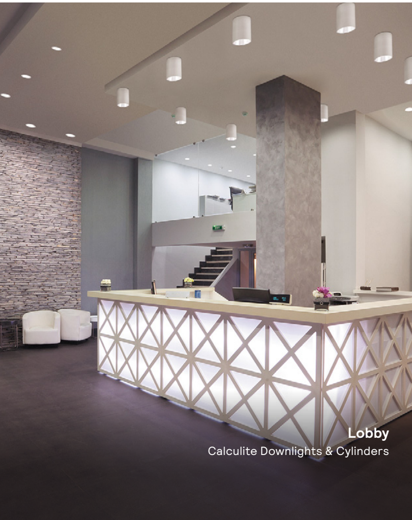
Lobby Calculite Downlights & Cylinders