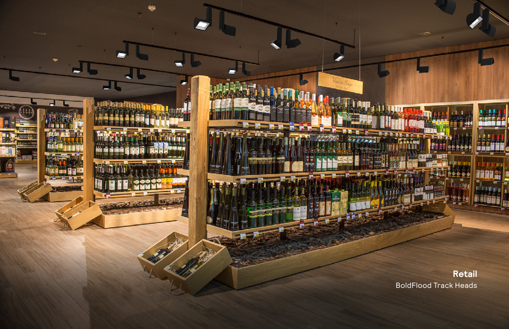
Retail BoldFlood Track Heads