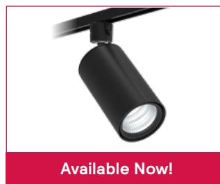
3D Printed Track Heads