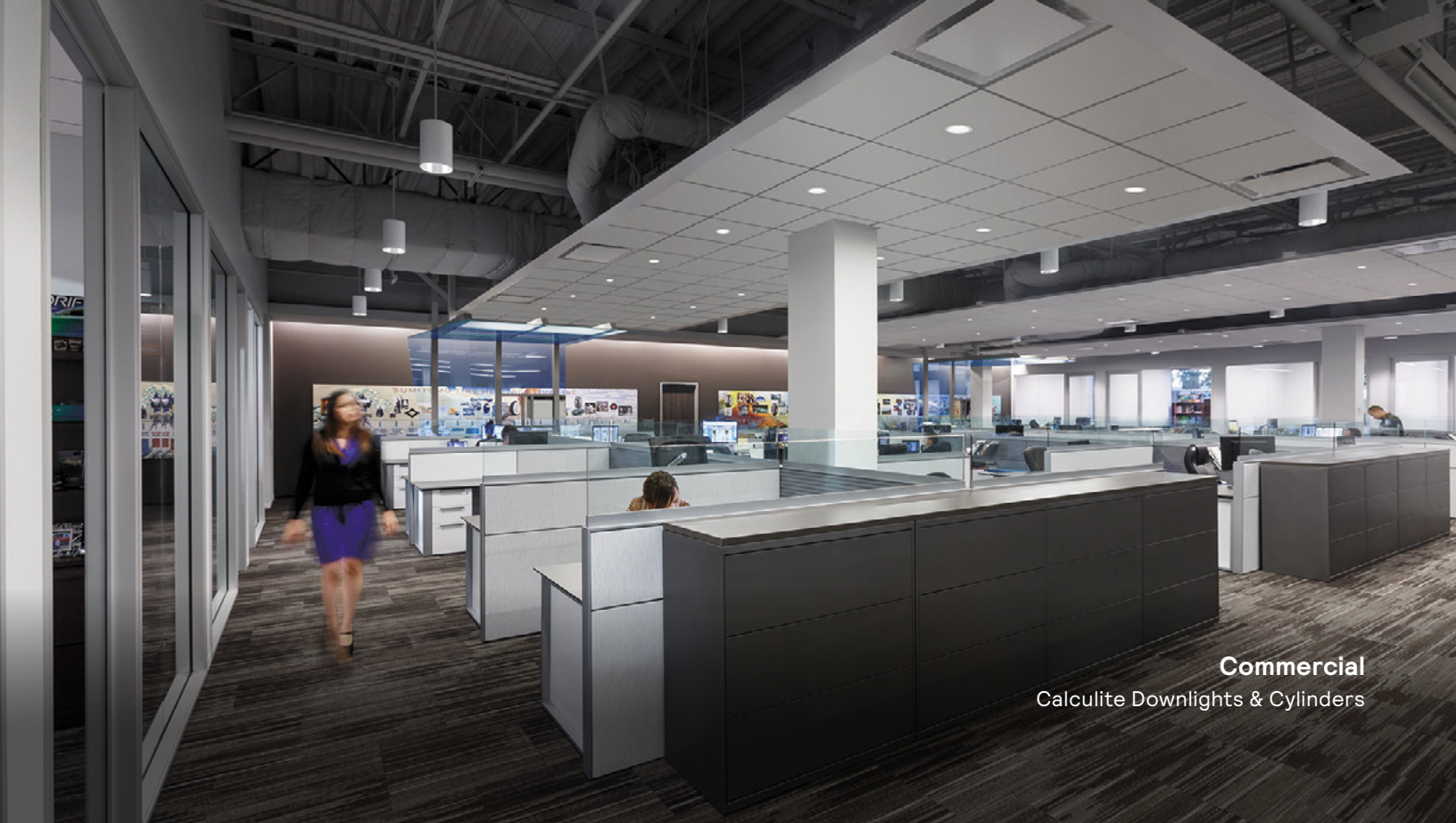
Commercial Calculite Downlights & Cylinders