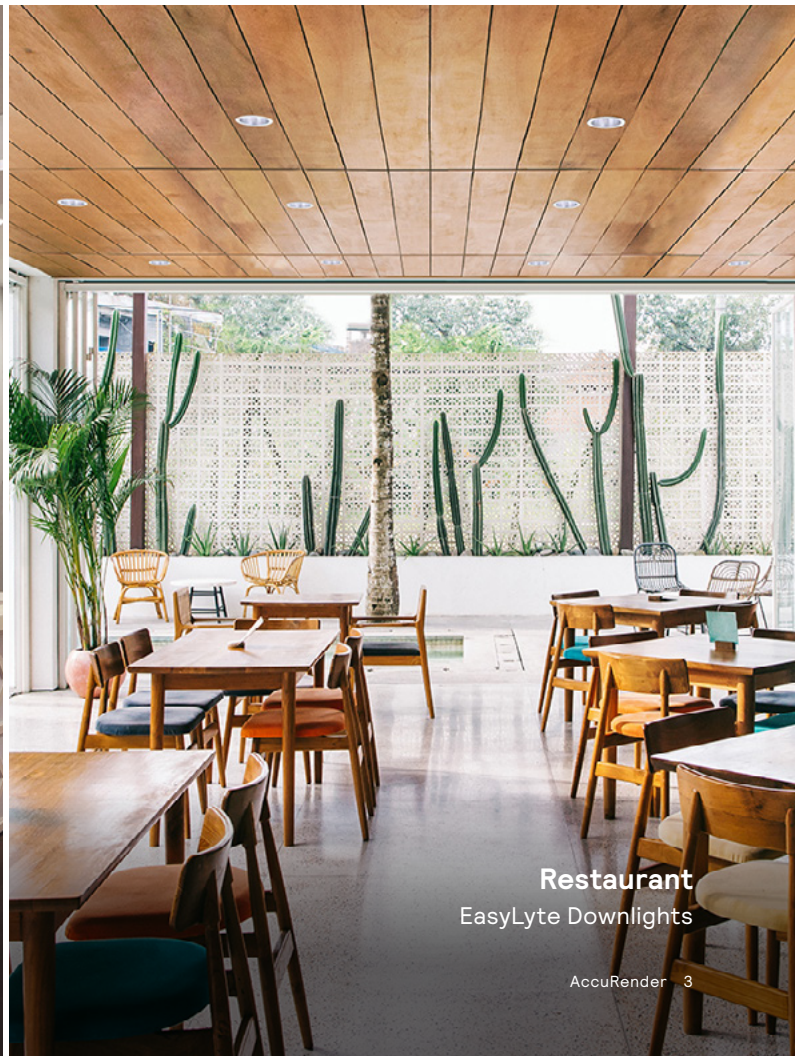
Restaurant EasyLyte Downlights