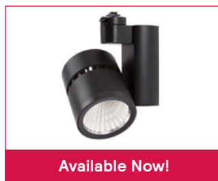
Alcyon Vertical Track Heads