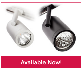
OmniSpot Track Heads