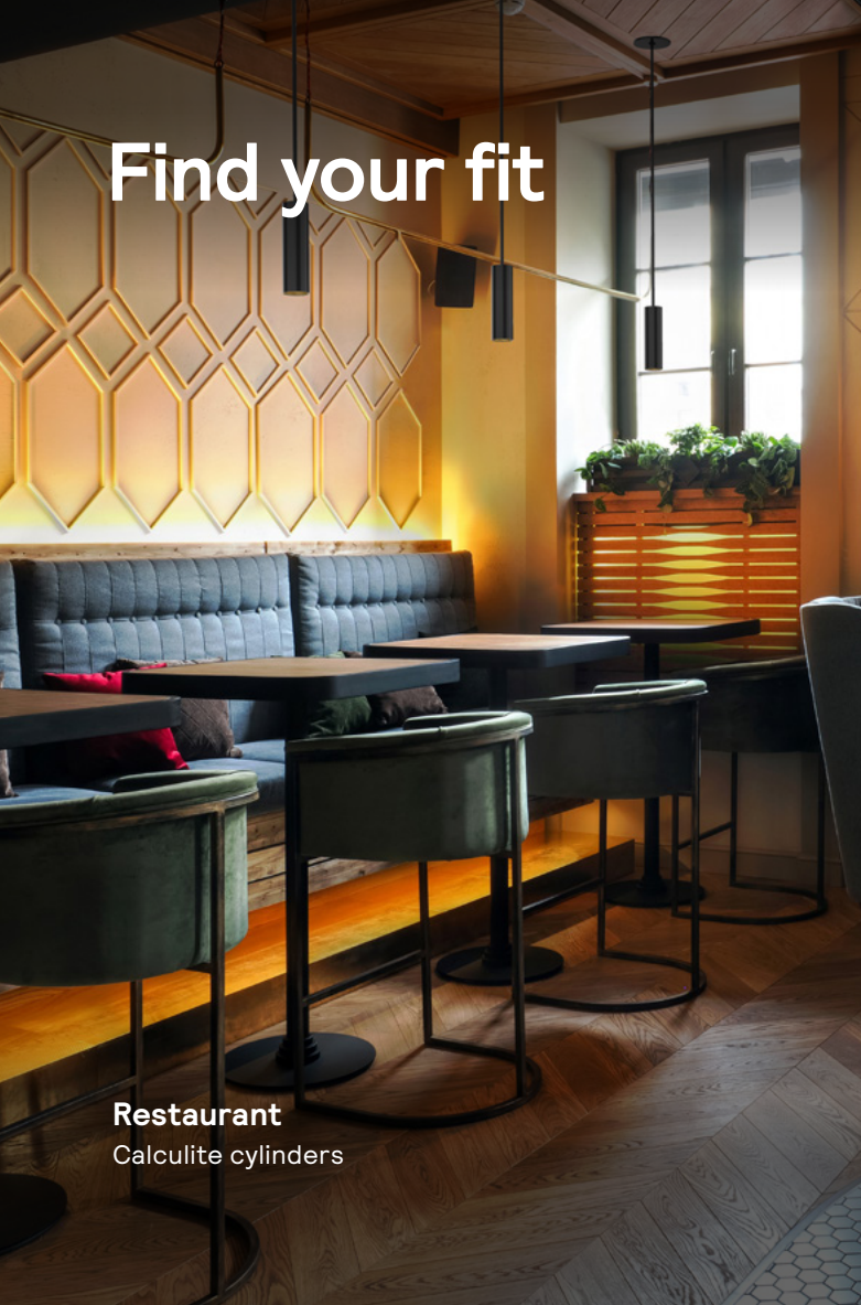
Restaurant Calculite cylinders