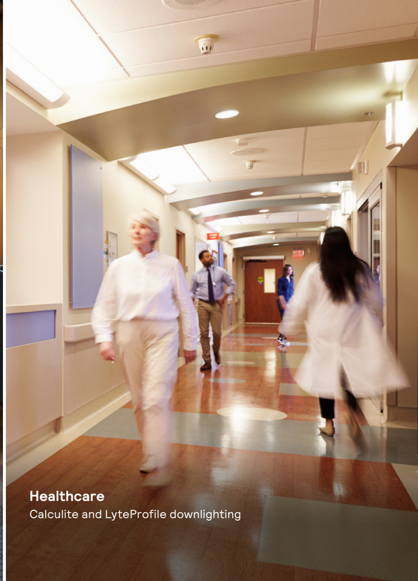
Healthcare Calculite and LyteProfile downlighting