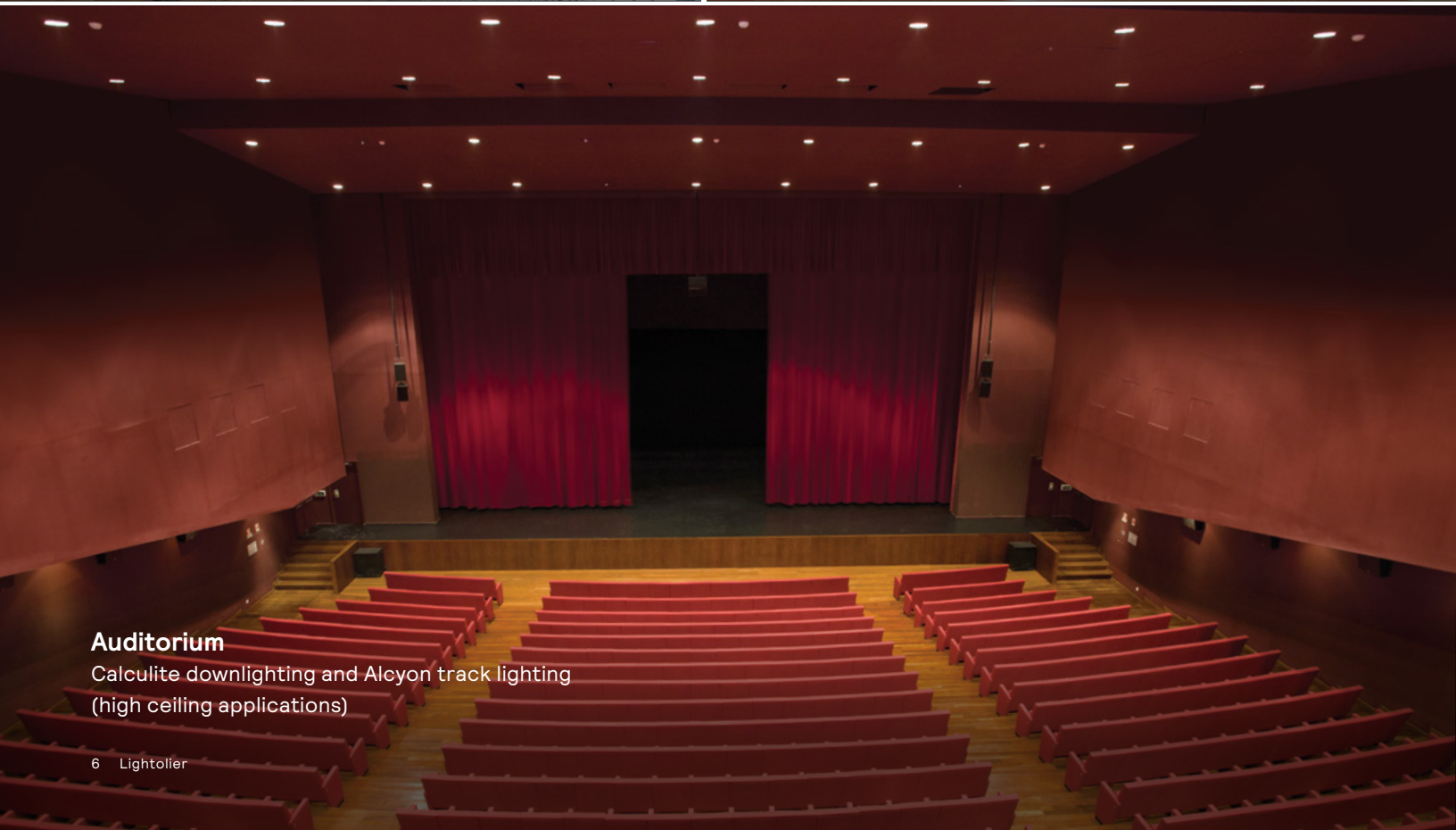
Auditorium Calculite downlighting and Aleyon track lighting (high ceiling applications)