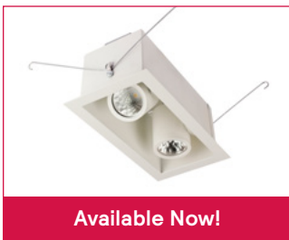
OmniSpot Recessed Multiple Cylinders