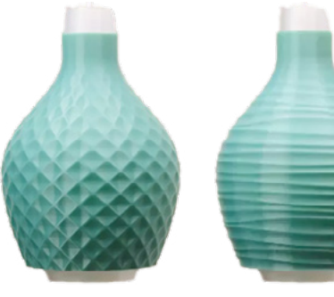
FC Fishnet Coarse