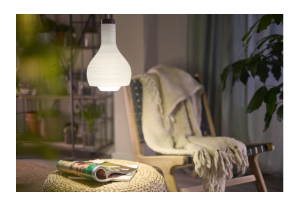
It's easy to see how harsh lighting can strain the eyes. Too bright, and you get

the glare. Too soft and you experience flicker. Now you can gently light up your world with LEDs designed to go easy on the eyes, and create the perfect ambience for your home.