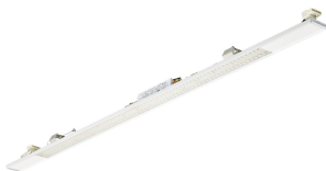
Maxos universal panel PSU