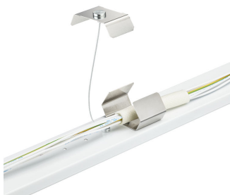
Maxos universal panel springs