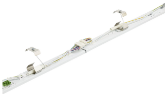
Maxos universal panel Through wiring