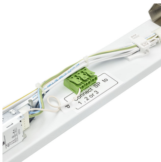
Maxos universal panel phase selector