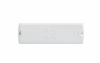
Emergency Light Bulkhead