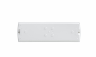
Emergency Light Bulkhead