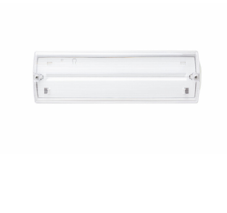
Emergency Light Bulkhead