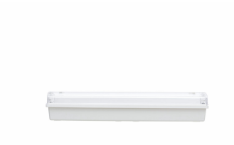
Emergency Light Bulkhead